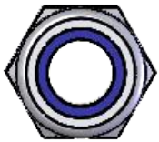
FN006 (M8) x 18