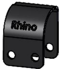
MS201 x 6