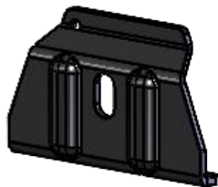
MS006 x 6