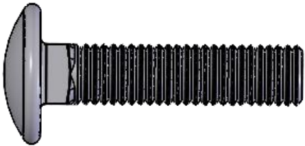
FS030 (M8 x 35) x 6