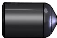
PS045 (M8) x 6