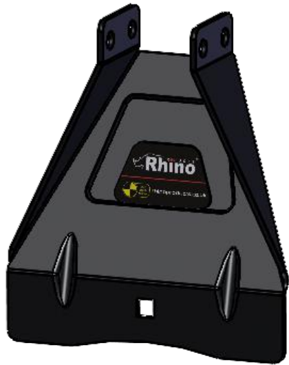
MS046 x 6